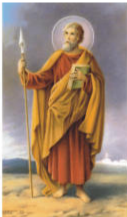
St. Thomas, Apostle